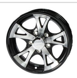
ALUMINUM SPORT RIMS